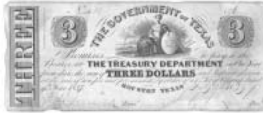
Certificate of Warranty. Three Dollar Denomination. Produced by the Republic of Texas in Houston in 1837.

Special Collections' materials pertaining to the Texas colonial period as well as the Mexican-American War years. The company's goal is to diffuse culture through the preparation and execution of artistic programs, exhibitions, concerts, and lectures designed to promote the fine arts in Mexico. The exhibition titled "México, los Proyectos de una Nación, 1821-1888," included sheet music and newspapers from the war years published