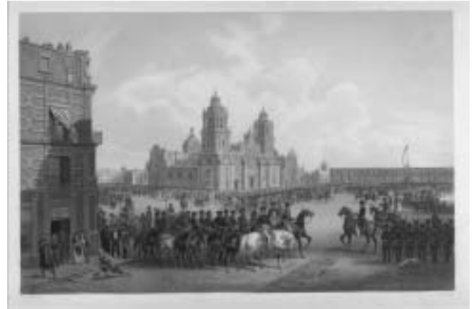
Lithograph. "Scott's Entrance into Mexico City" by Carl Nebel from Geo. Wilkins Kendall's The War Between the United States and Mexico Illustrated . Published in New York by D. Appleton & Company in 1851.

Bullock Museum is a dynamic educational institution that engages visitors in the exciting story of Texas through a variety of program and exhibit experiences. The museum hosts more than 200,000 visitors every year on its three floors of exhibition space and in its two theaters.