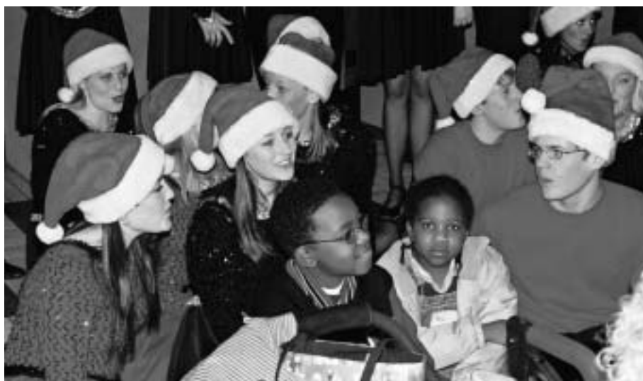
Children attending the Friends' holiday program were invited to join the Martin High School choirs for a couple of songs.