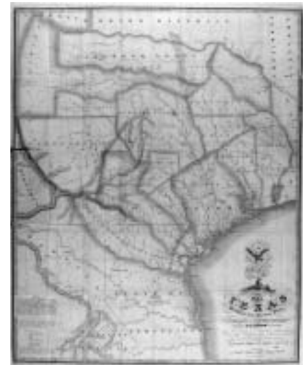
Copper Engraving. Map. Map of Texas with Parts of the Adjoining States compiled by Stephen F. Austin. Published in Philadelphia by H. S. Tanner in 1836.

Loans to museums, television, and media productions allow Special Collections to share the bounty of its collections with others across the state and the nation as well as other countries. Many of the museums, in addition to their displays, provide ways for the items to be incorporated into the educational system with their in-house programs for teachers, lesson packets for students, and other onsite programs and publications. The television and print media broadcasts and publications reach viewers in the hundreds of thousands, more than could ever visit the campus and view the rare books, maps, and documents housed in the division. The institutions and publications always credit Special Collections, The