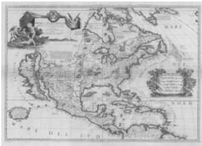
Copper Engraving. Map. America Settentrionale Colle Nuove Scoperte fin all'Anno 1688 . Published by Coronelli, in 1695.

Maps also were the subject of a loan to the Museum of the Big Bend. The museum presented an exhibition focusing on the boundary questions that arose with the annexation of the Republic of Texas to the United States in 1845 and Treaty of Guadalupe Hidalgo that ended the Mexican-American War of 1846-1848. The museum requested a number of maps relating to the treaty as well as the presentation copy of the Treaty of Guadalupe Hidalgo that resides in Special Collections.