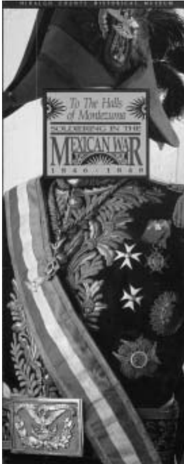
Exhibition Brochure. To the Halls of Montezuma: Soldiering in the Mexican War 1846-1848 . Published by the Hidalgo County Historical Museum, Edinburg, Texas, in 1998.

of noted cartographers, such as Martin Waldseemüller, Abraham Ortelius, Jodocus