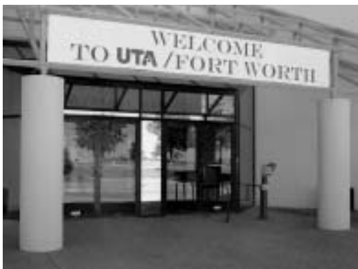
The UTA Fort Worth Campus contains one of the Libraries' several satellite locations. The library is on the third floor.