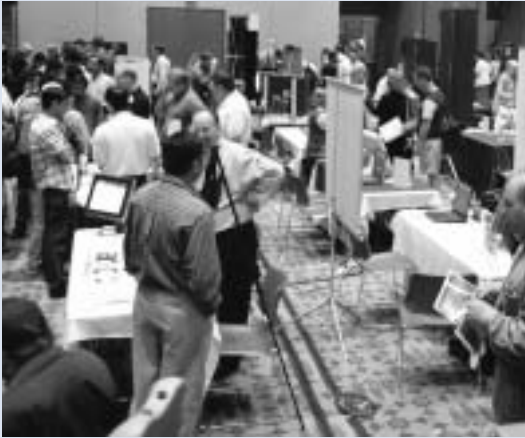
Attendance more than doubled at this year's Tech Fair, held in the University Center's Bluebonnet Ballroom on Oct. 29, 2003.